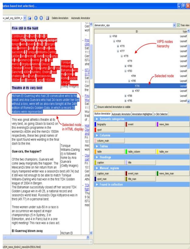
Figure 3: Annotation of a single web page with blocks corresponding to a topic

in order to meet the BOEMIE's requirements. However it has the advantage that it can be added to any system as it has no external dependencies and runs in a form of a component inside a system created in the Ellogon environment. The component takes as input an annotated document and produces an OWL ABox or XML file with respect to the concepts and relations given in the defined domain ontology.